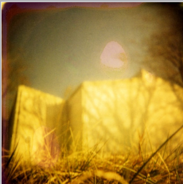
Unseen Architecture #7